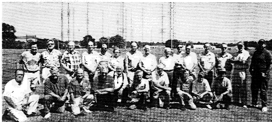
The gathering of the faithful at Cedar Rapids on August 17, 1995 is recorded for posterity. In the background is a portion of the famous antenna farm for Collins Comm-Central.

The meet concluded Sunday with a visit to the Cedar Valley Amateur Club annual hamfest. A third trip to Cedar Rapids is planned for this coming summer.